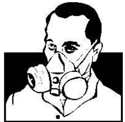
Safety Equipment Required

Improper installation, adjustment, alteration, service or maintenance can cause injury or property damage. Refer to this manual and the Power Flame burner manual. For additional assistance or additional information, consult a qualified installer, service agency, or call AFC at our toll-free number, (800) 331-7744.