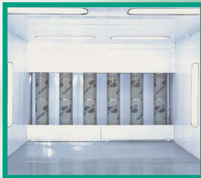
Powder Coated Cartridge Booth

Manual or automatic feed application systems are available.