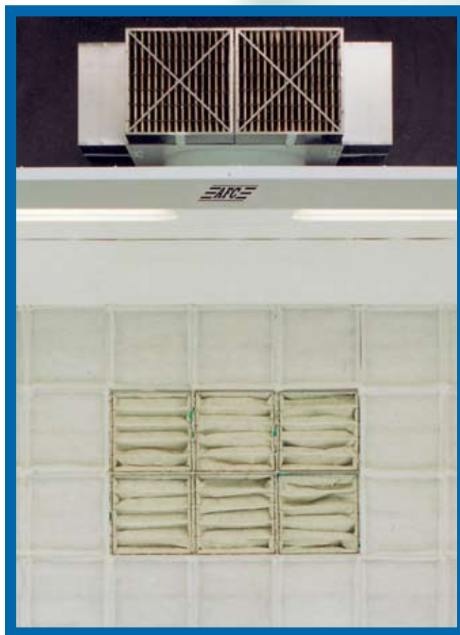
Three Stage Filtration