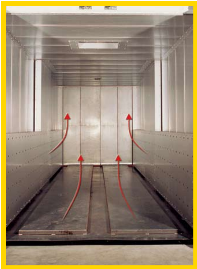
Aluminized Oven Interior