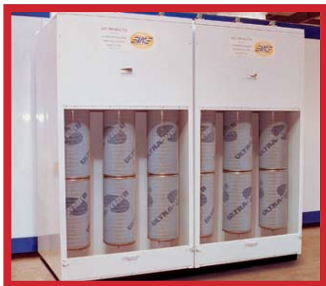
Powder Coating Modules