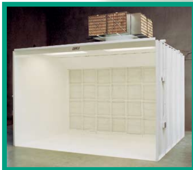
Pocket Filter Booth

AFC's pocket filter booths feature three-stage filtration. The primary filtration is handled by polyester and the secondary filters are a pocket style also of polyester material. The final filtration, before allowing the air back into the work area, is handled by way of condensed paper media. These pocket filter booths can be ordered in either a galvanized or powder coated finish.