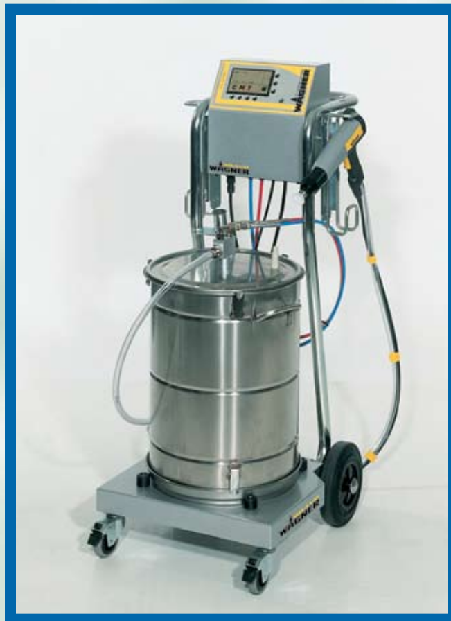
Electrostatic Powder Applicator